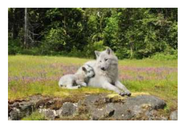
KJV (Isaiah 11: 6) 6 The wolf also shall dwell with the lamb, and the leopard shall lie down with the kid; and the calf and the young lion and the fatling together; and a little child shall lead them.