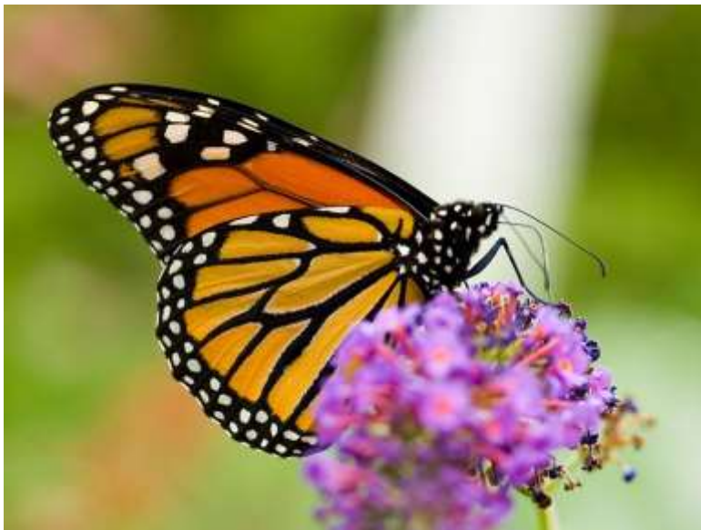
Monarch Butterfly

A short video: Insects in decline : https://www.youtube.com/watch?v=gEabihwoZwM