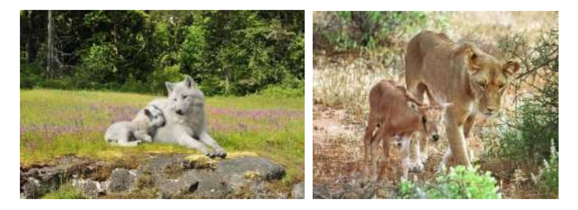
In the coming tribulation of Christians, remain steadfast in faith in Jesus' words, in God's peace: (See: <u>https://www.gatestoneinstitute.org/14281/genocide-of-christians</u>)

NKJV (Isaiah 11: 6-10) 6 "The wolf also shall dwell with the lamb, The leopard shall lie down with the young goat, The calf and the young lion and the fatling together; And a little child shall lead them. 7 The cow and the bear shall graze; Their young ones shall lie down together; And the lion shall eat straw like the ox. 8 The nursing child shall play by the cobra's hole, And the weaned child shall put his hand in the viper's den. 9 They shall not hurt nor destroy in all My holy mountain, For the earth shall be full of the knowledge of the Lord As the waters cover the sea. 10 "And in that day there shall be a Root of Jesse, Who shall stand as a banner to the people; For the Gentiles shall seek Him, And His resting place shall be glorious."