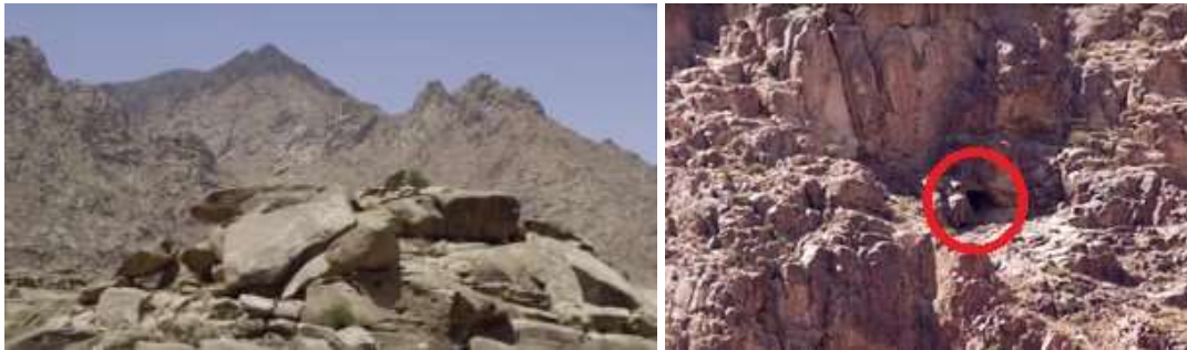
Left: The black peak of Mount Sinai in the Horeb mountain chain. Right: The cave of Elijah.